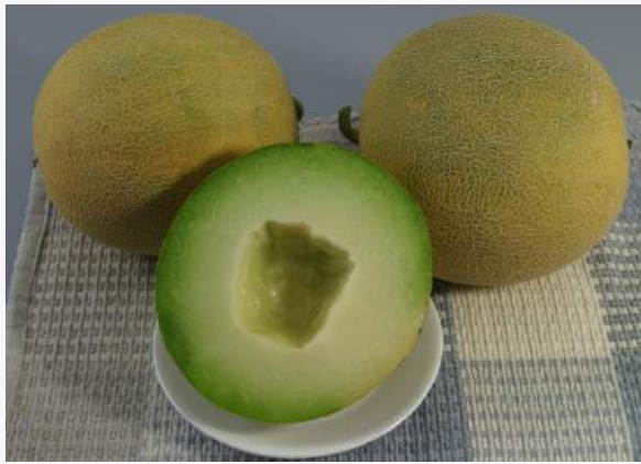
Melon – Adel F1 (GGS 313)