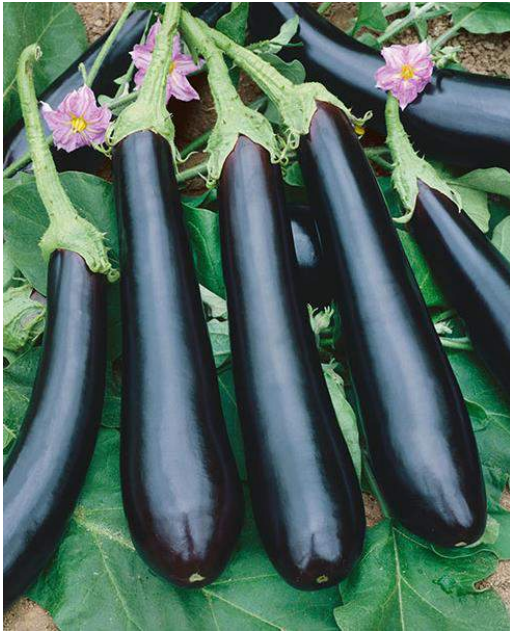
Brinjal F1 GGS 501